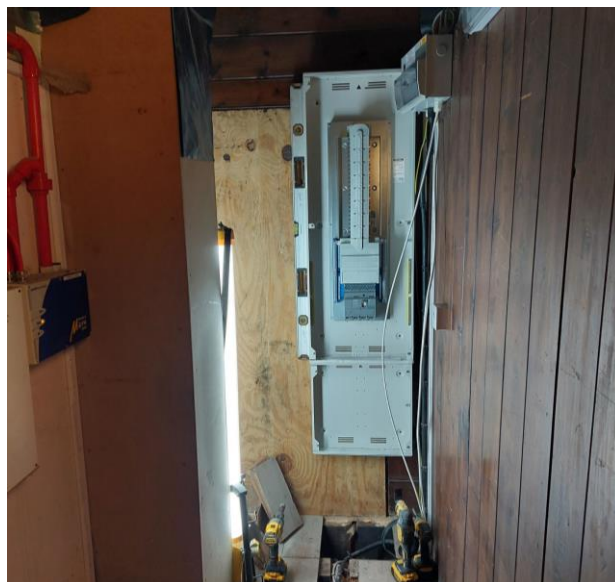
Photo: View towards what was once south Vestry internal door

Building: Service trunking pinned to walls