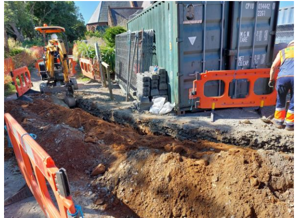
Photo: Cathedral car park looking up the roadway in the middle of the Franciscan Garden

Building: Debris removed from under floor and ground compacted (sandstone retained for new entrance to the Cathedral at Derby Road bus stop)