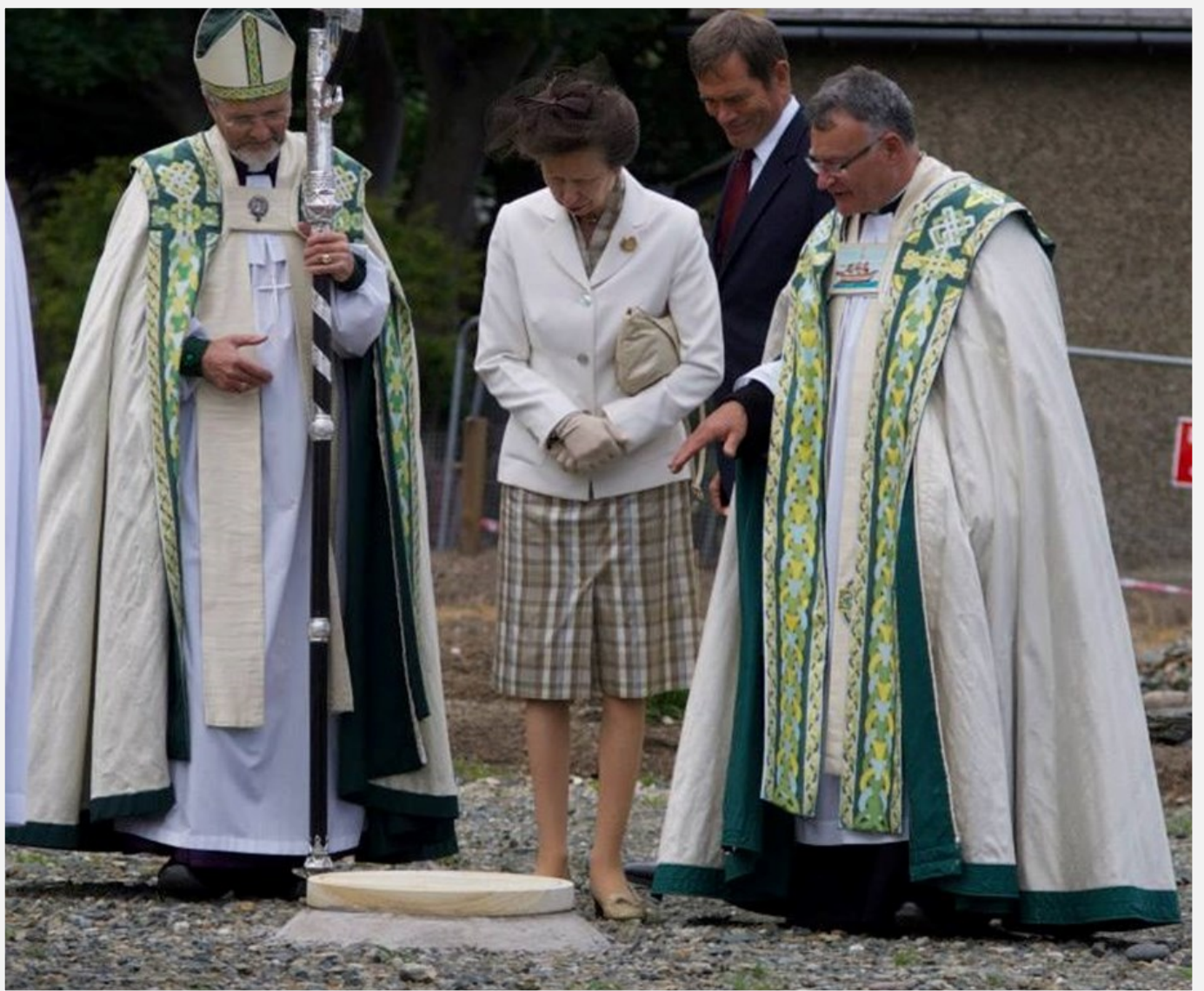
Her Royal Highness the Princess Royal unveiling the Foundation stone for the Labyrinth.